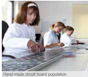
Hand-made circuit board population