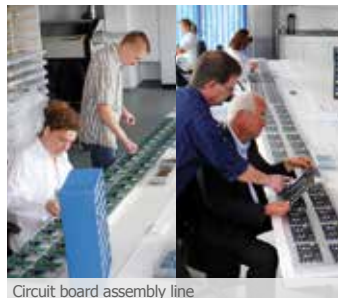
Circuit board assembly line