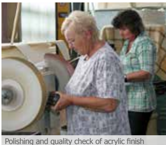
Polishing and quality check of acrylic finish