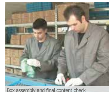
Box assembly and final content check

tel: +49 (0)30 - 23 60 77 8-0 fax: +49 (0)30 - 23 60 77 8-10 email: info@cwt-international.com web: www.cwt-international.com