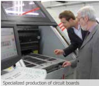
Specialized production of circuit boards