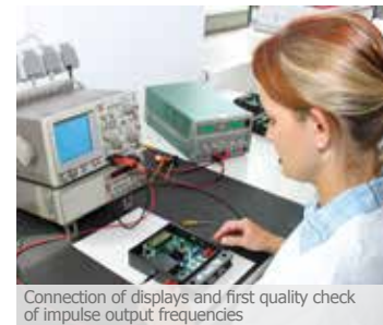
Connection of displays and first quality check of impulse output frequencies

CWT – Christiani Wassertechnik GmbH Köpenicker Str. 154 10997 Berlin Germany