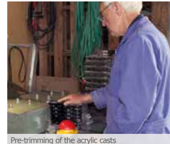
Pre-trimming of the acrylic casts